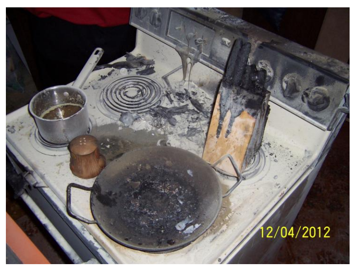
Kitchen Cooking Fire

Total Number of Incidents 209 Total Number of Responding Personnel 4853 Average Turnout per Incident 24