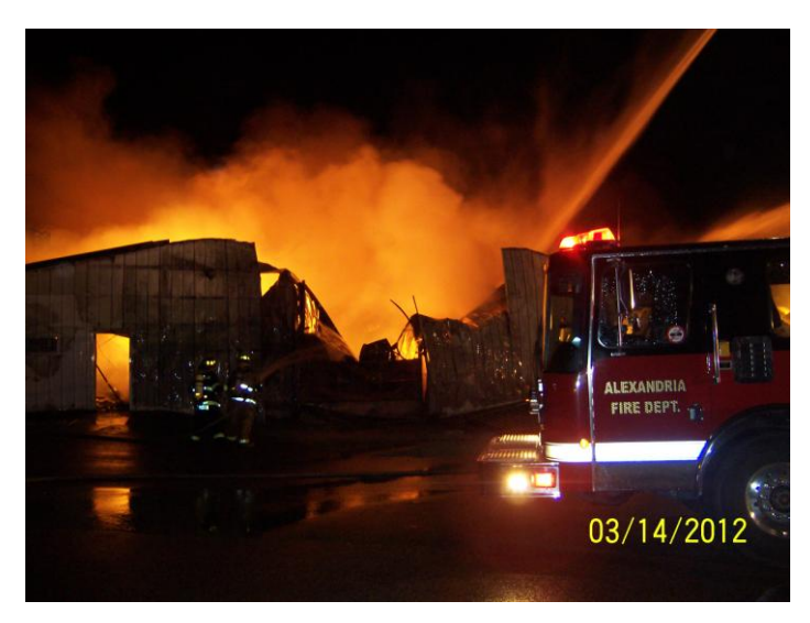
Mutual Aid to Garfield