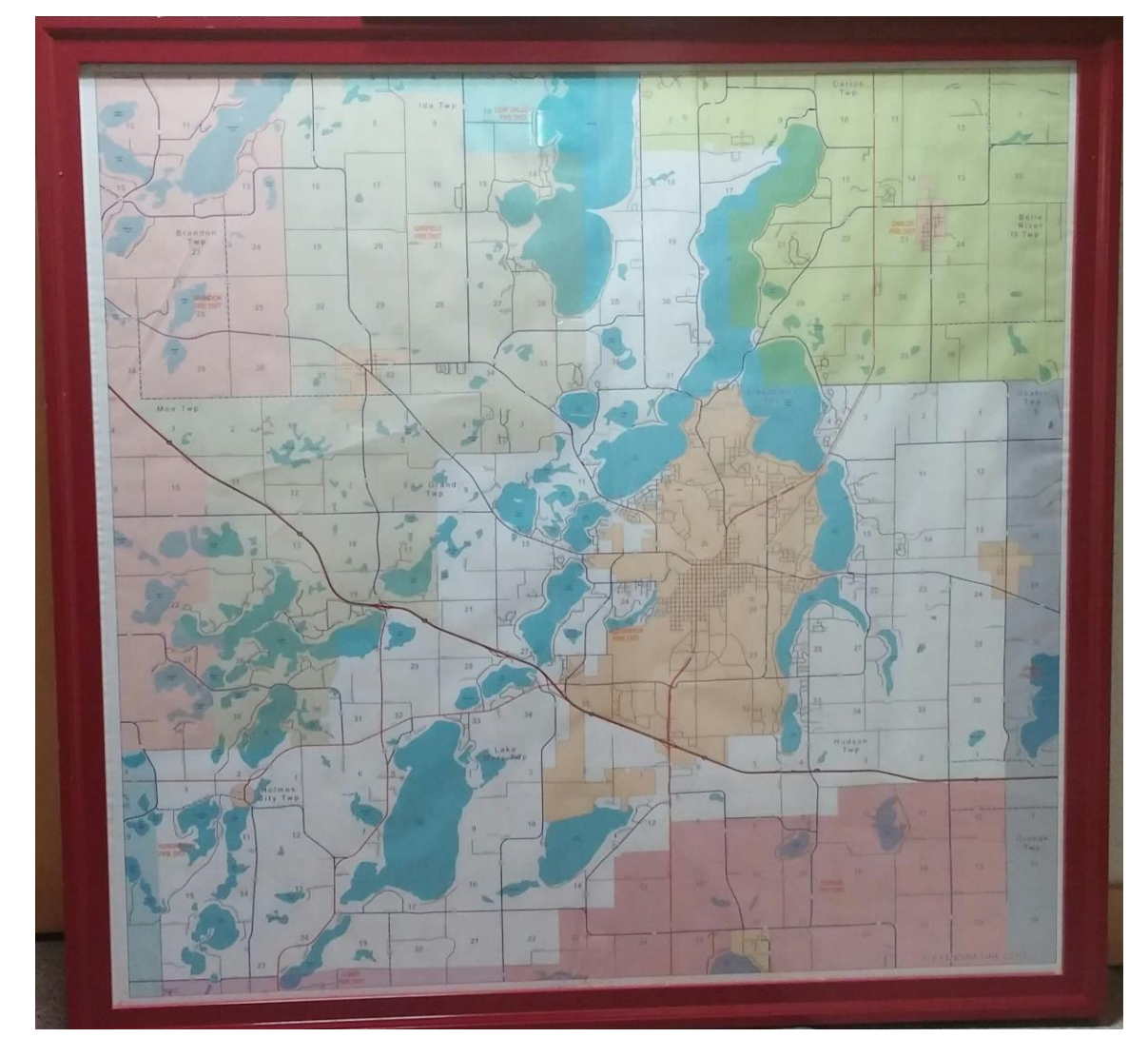
White – Alexandria Fire District Tan – Alexandria City limits

(2014 estimates)TOTAL POPULATION OF SERVED 21,422 ***AFD Fire District - Approximate 135 square miles