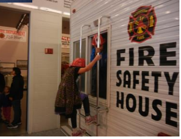
2015 Open House at the Fire Station

<u>Code Enforcement</u> - approx. 96 inspections (mostly new construction), 27 plan reviews, MFIRS reports for 176 calls entered into database and submitted to State Fire Marshal. Regular and special inspections conducted throughout the year. There are approximately 315 buildings in the city that have automatic fire sprinkler systems.