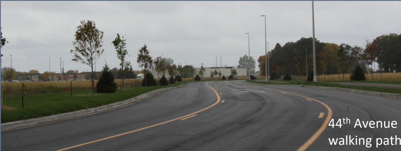
44 th Avenue with side right walking path