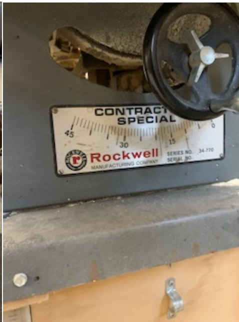
Old Rockwell Table saw – 110v works great