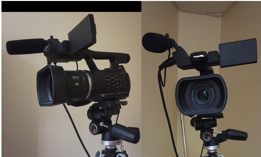
Panasonic camera – SD card