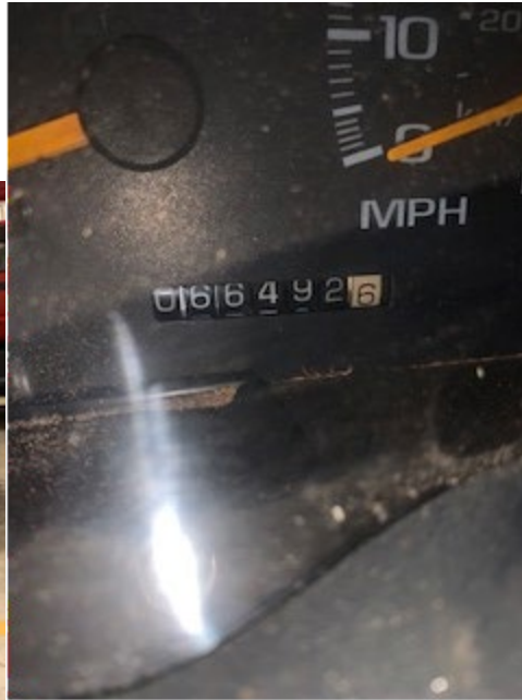
1996 Chevy 3500 Diesel with 1 ½ yard hydraulic lift steel dump box – sold as is