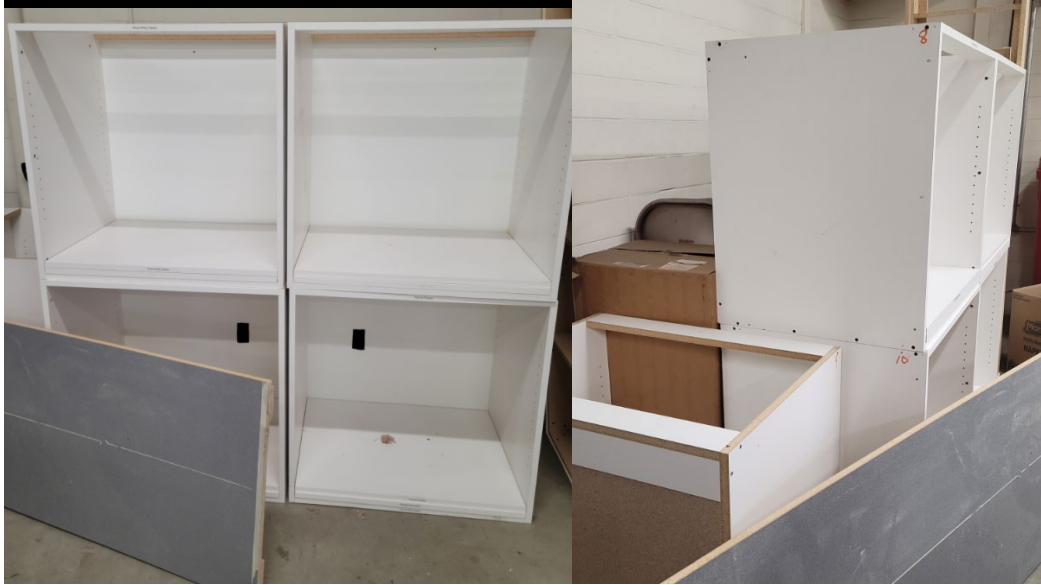
Old Vault shelving