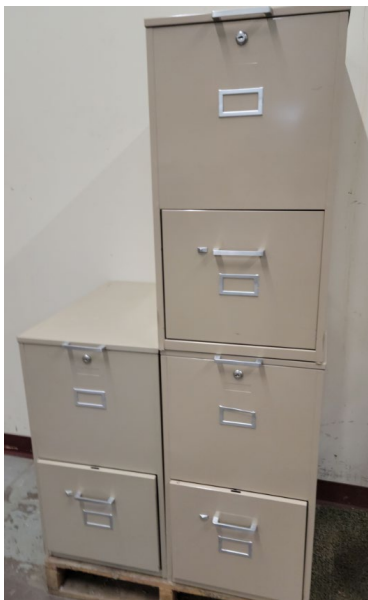
Three – 2 drawer fliptop file cabinets.

Bid should be for one, highest bidder will take as many as wanted, next highest bidder will take the remainder.