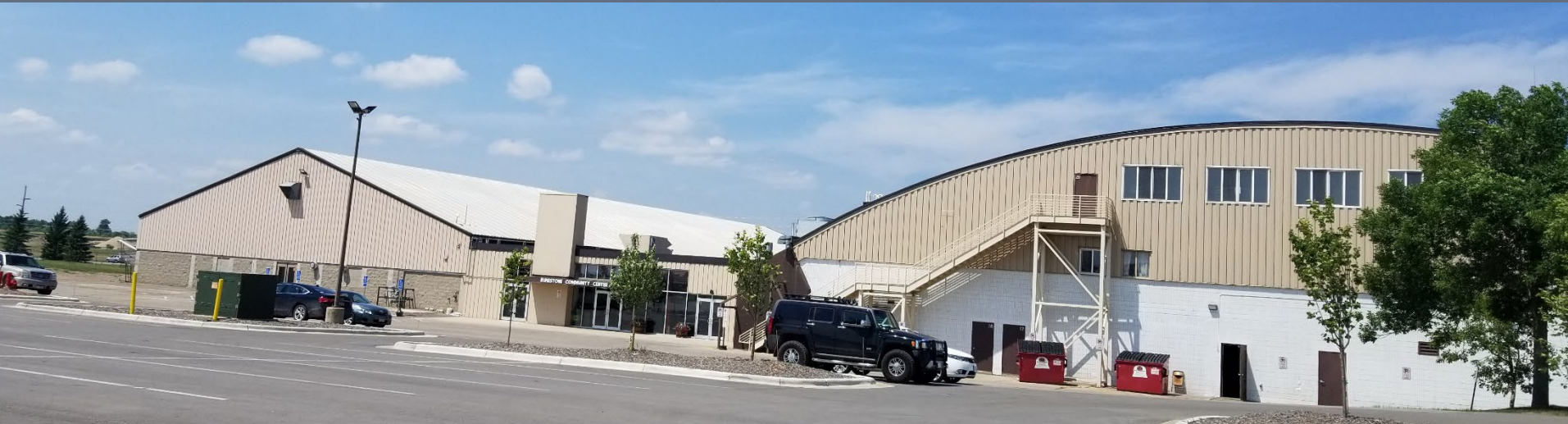
Runestone Community Center