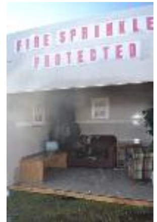
Live Burn Demos