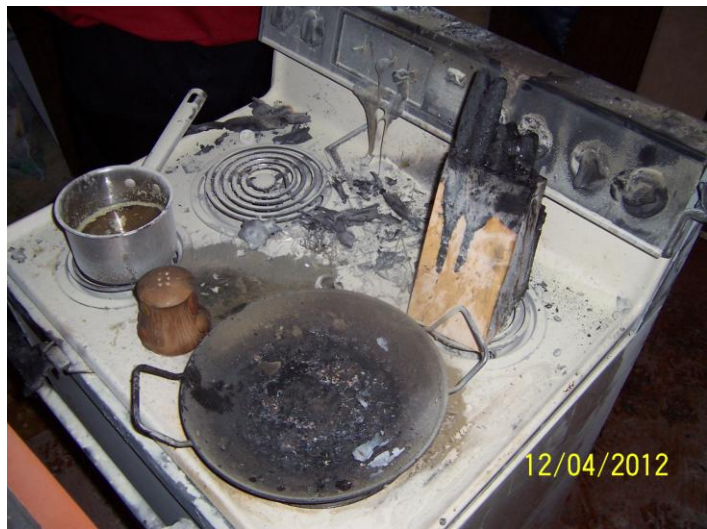
Kitchen Cooking Fire