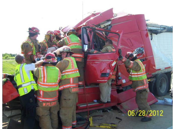
AFD Firefighters working on vehicle accident