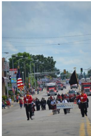
2012 MSFDA Conf Parade