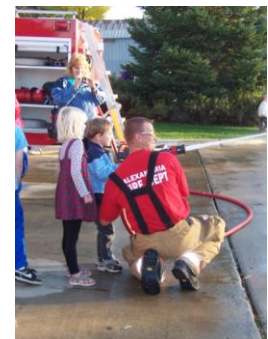
2012 Open House at the Fire Station