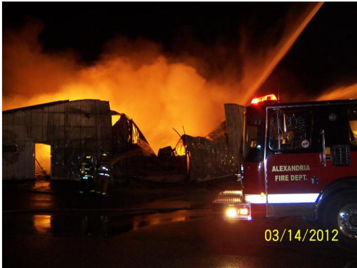
Mutual Aid to Garfield