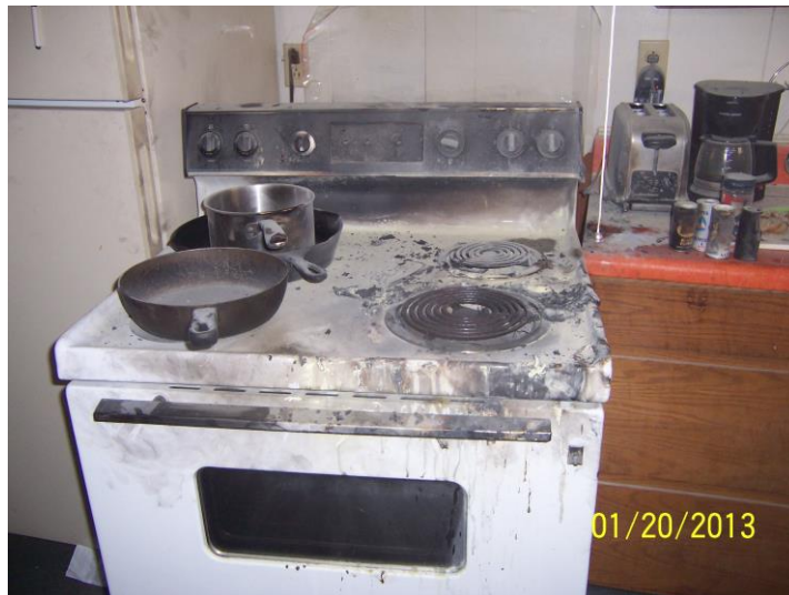
Kitchen Cooking Fire