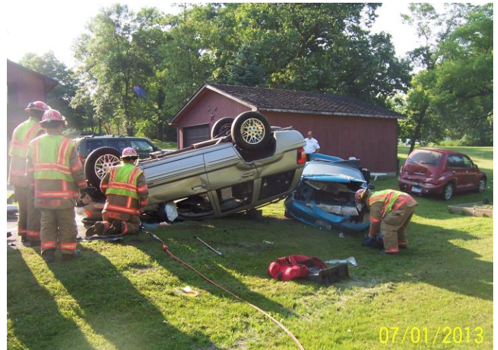
AFD Firefighters working on vehicle accident