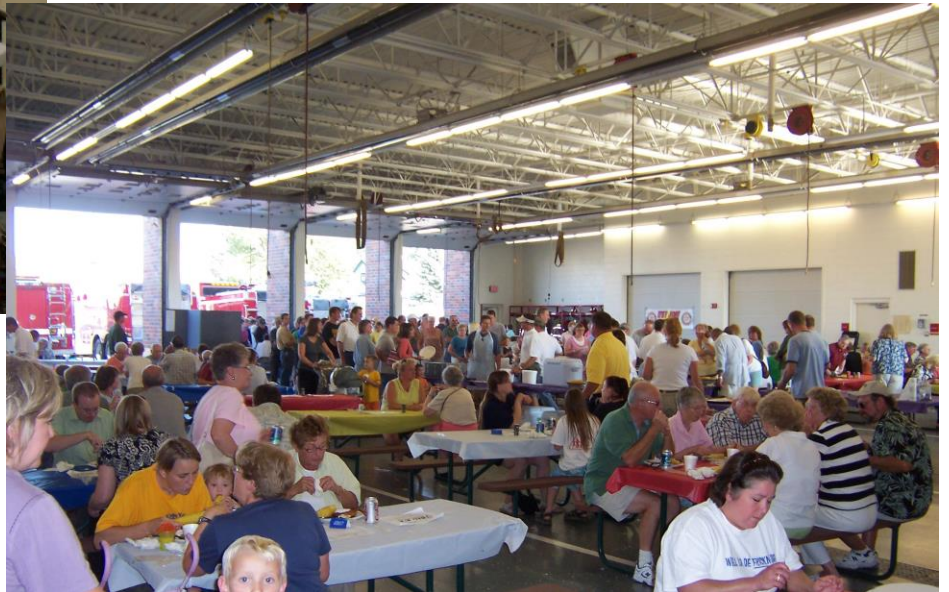
Rotary & AFD Pork & Corn Jubilee