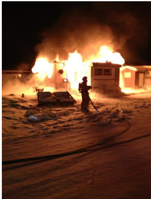
Mobile Home Fire 2014