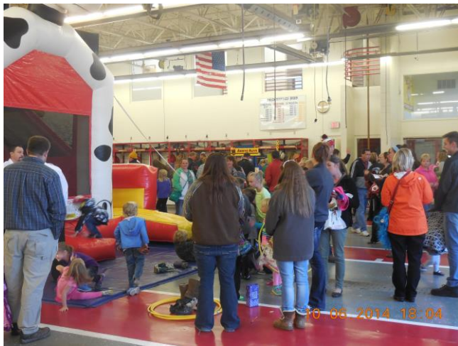
Fire FUN Hopper