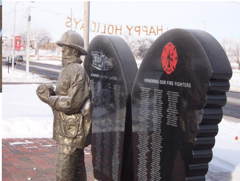
AFD Firefighters Memorial