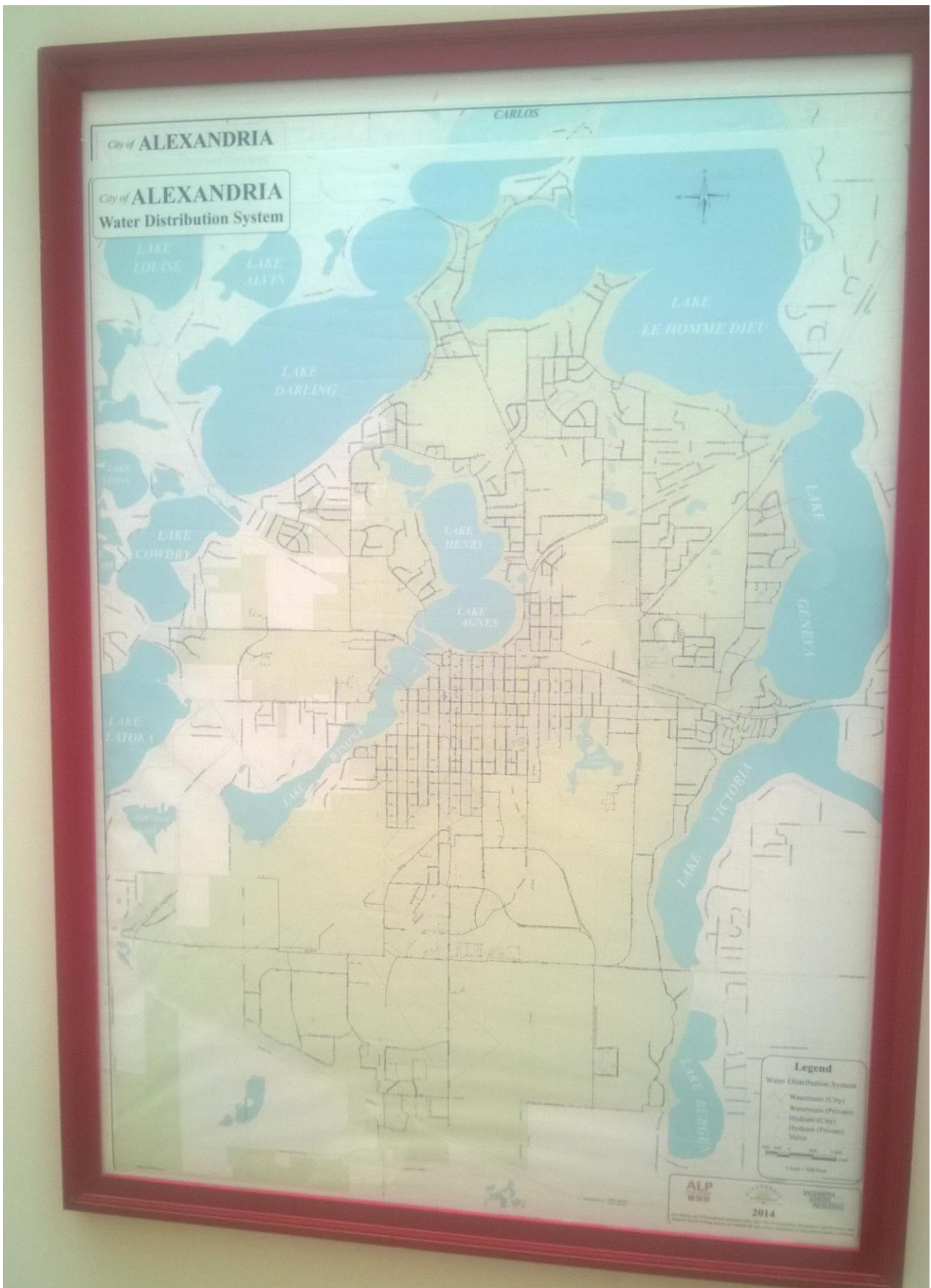
Municipal Water Supply & Hydrant locations