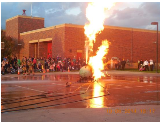
LP Burn Demo