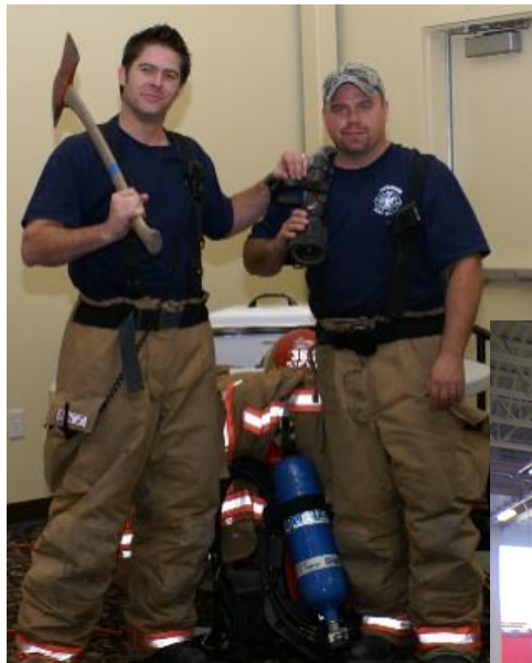
United Way Chili Cook Off