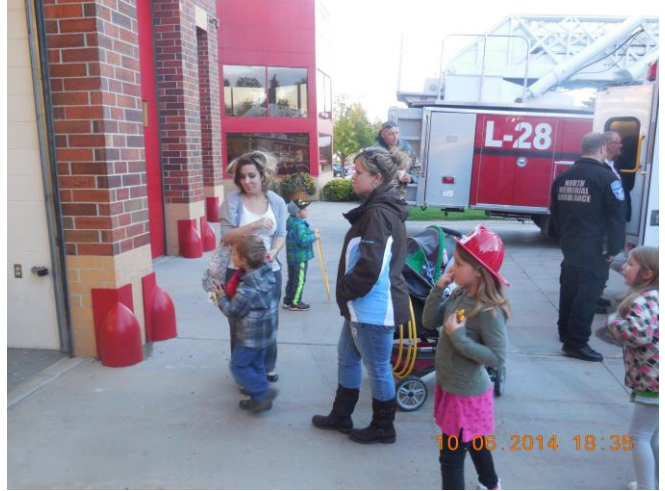
Families at AFD Open House