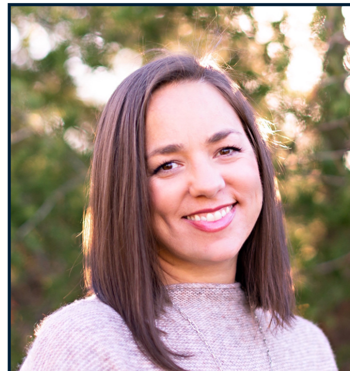
Kimberly Albert Public Relations